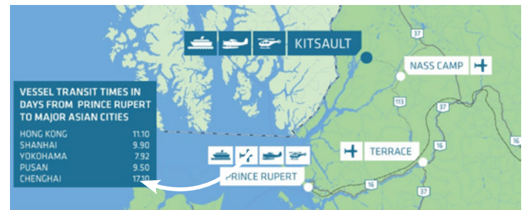
Vessel Transit Times

Unlike other costly and controversial projects—such as Alberta's investment in the now-defunct TransCanada XL Keystone pipeline—KE provides an economical and low-impact alternative. KE has already secured the necessary regulatory approvals from NEB for a 20-year LNG export permit for up to 20 million tonnes annually, along with a multi-billion USD housing infrastructure and investment in Kitsault. The two existing and approved pipeline routes by Spectra Energy/Enbridge enhance the feasibility and speed of implementation. The project's location—away from Prince Rupert and other sensitive areas—ensures minimal disruption to marine ecosystems and Indigenous fisheries in the